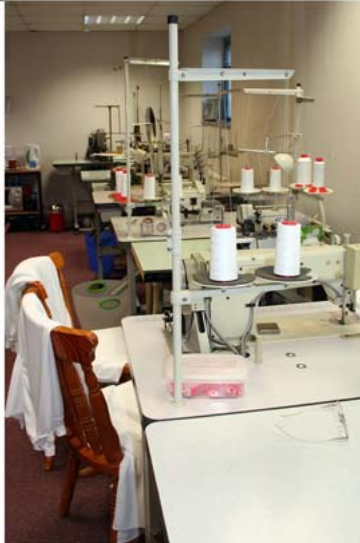
Our tiny manufacturing facility in Mansfield, UK

...when the alarm goes off in the morning Lookfly is something we are happy to get out of bed for.