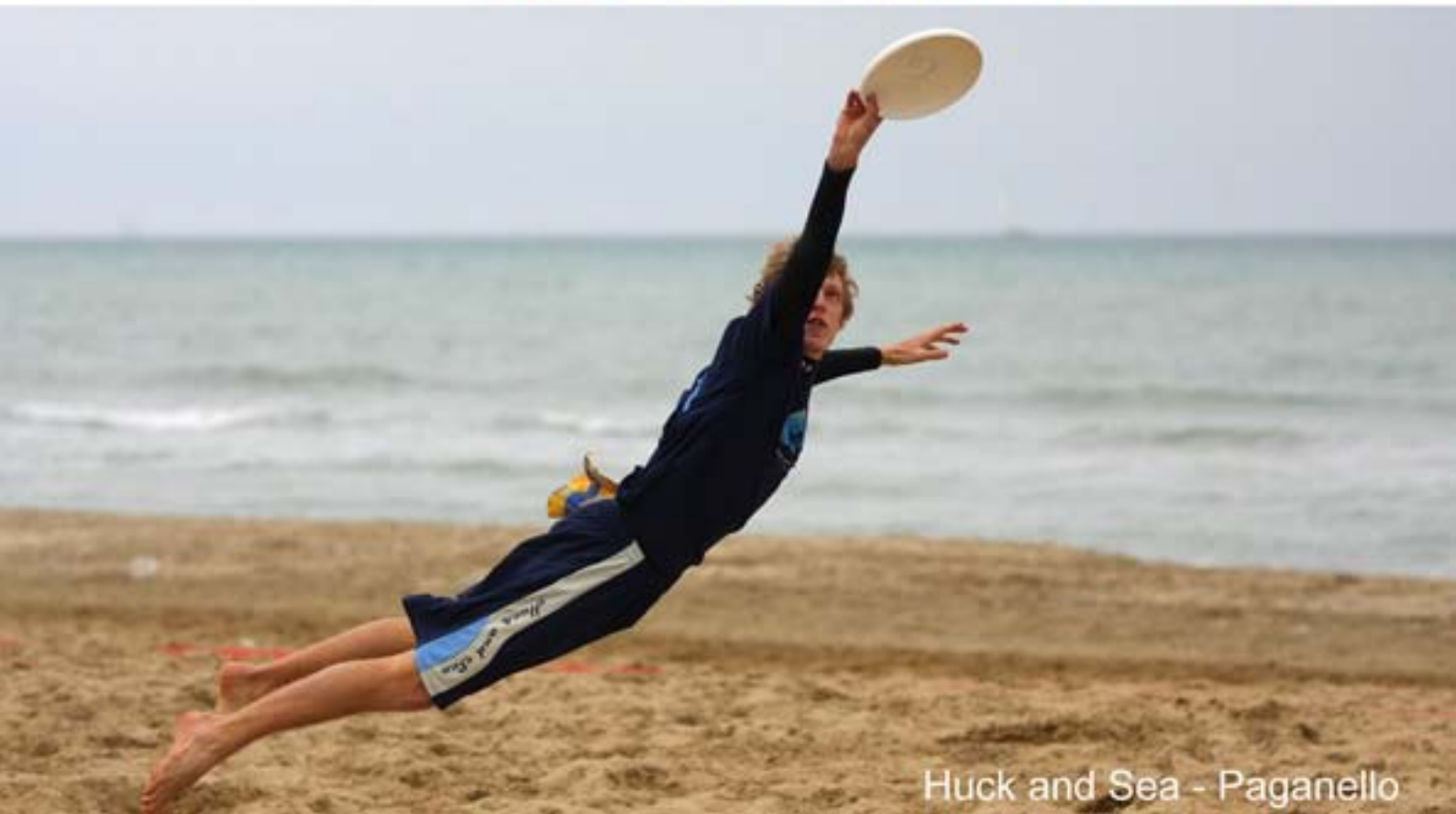
Huck and Sea - Paganello