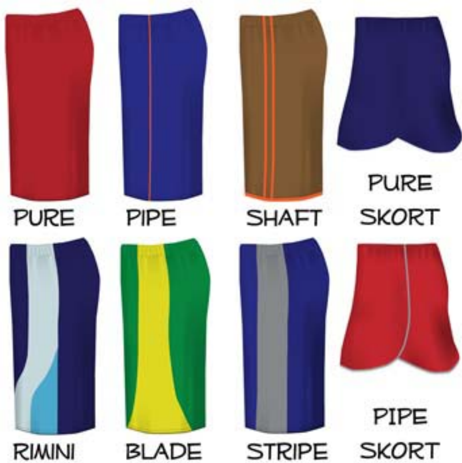
Steph Weekes - WCBU Brasil